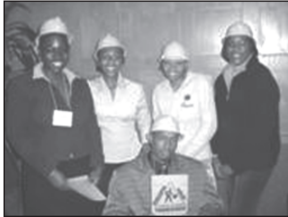
Business Professionals of America (BPA) students