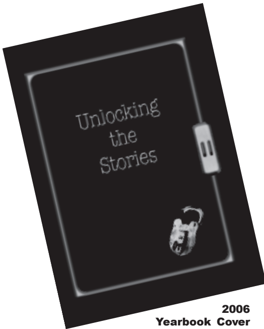
2006 Yearbook Cover

Questions can be forwarded to the yearbook adviser at 773.535.9990.